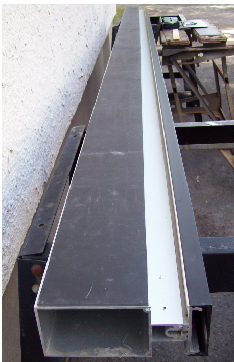
Figure 1: Validation testing setup, with mass-loaded barrier applied to one of the window mullion surfaces.

Finally, the insulation was removed, and tests were completed with one and two of the mullion surfaces covered with a barium-loaded vinyl product, which had been selected for a high surface weight (2.0 lb/ft 2 , or approximately 9.8 kg/m 2 ). The stimulus and measurements were both located on surfaces without the mass-loaded barrier treatment. The acceleration response was reduced by approximately a factor of 2 with two of the three suite-facing surfaces treated, compared to the un-treated condition.